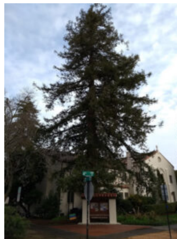
The Coast redwood in front of the Davis Community Church has grown from a diminutive young tree into a lofty guardian of this historic structure.